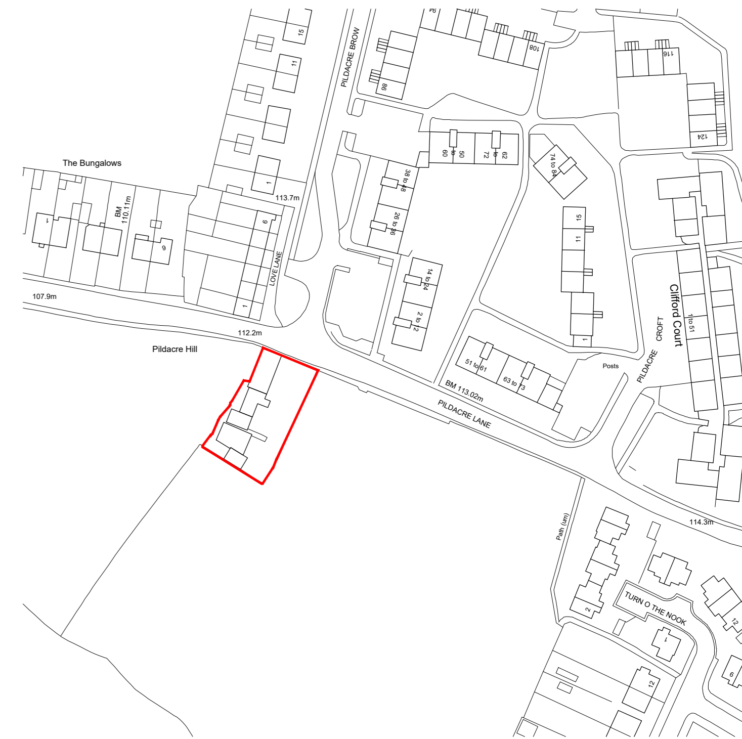
Location Plan 1: 1250