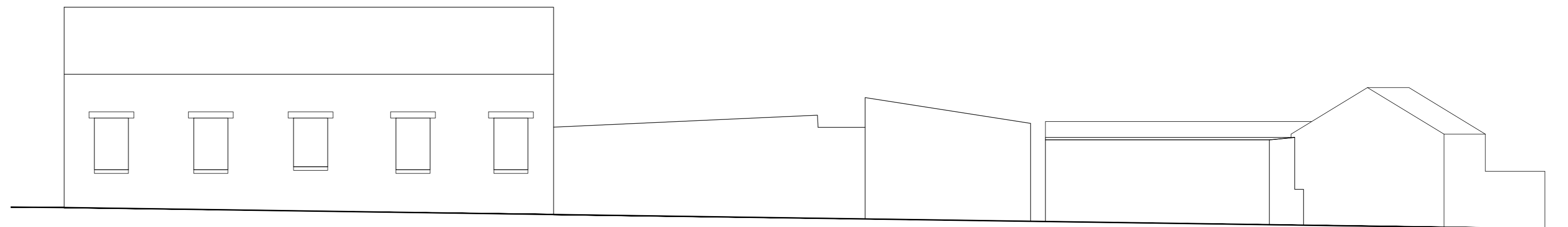
Western Elevation 1: 100